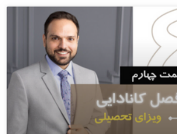
ویزای تحصیلی کانادا

در سال 2017 و به دلیل کمبود جدی نیروی کار در چهار استان آتلانتیک کانادا، یک برنامه مهاجرت امتحانی به نام برنامه مهاجرت آتلانتیک راه اندازی شد. در