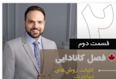
تمامی آنچه که باید راجع به روش های مهاجرت به کانادا بدانید

اگر شما هم به مهاجرت فکر می‌کنید، دانستن یک سری نکات می‌تواند تصمیم‌گیرنده‌ی نهایی شما باشد. در این قسمت به 4 نکته مهم که