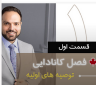
4 نکته مهم که باید قبل از مهاجرت به کانادا بد

https://www.shekarian.ca/canadian-chapter/