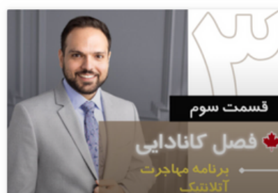
مهاجرت به کانادا از طریق برنامه آتلانتیک

برای مهاجرت به کانادا روش های مختلفی وجود دارد. در این قسمت سعی کرده ایم به صورت کلی، روش های مهاجرت به کانادا را بررسی کرده و هکدام را